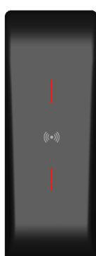
Red LED Access denied