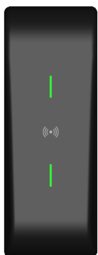
Green LED Access granted