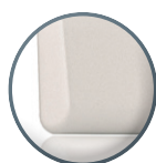
Ref: B100PBS-RS-EH Silver - ABS