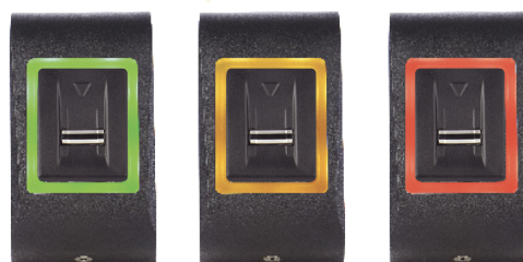
Green LED Access Granted