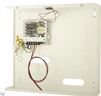
WS4-PS5 Input voltage: 100-240 V AC; 50/60 Hz Output voltage: 15 V DC Output current: max. 5 A IP factor: IP 30