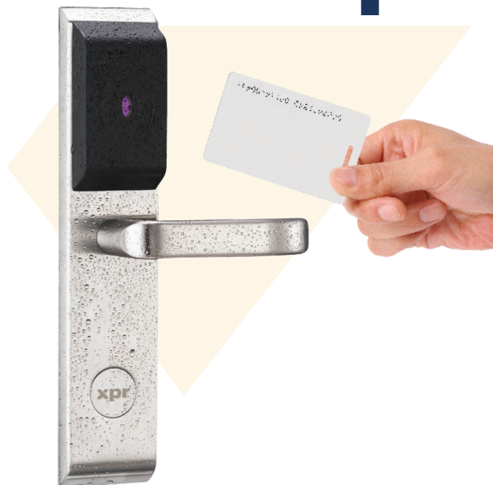
For indoor and outdoor use

It supports Mifare Classic 1K and 4K memory cards. It can store up to 3500 events in its memory and 500 cards in its blacklist, with unlimited user capacity.