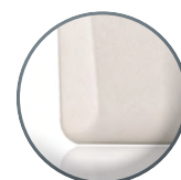
Ref: MTPXS-RS-MF Silver - ABS