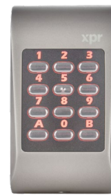
Red backlight Access denied