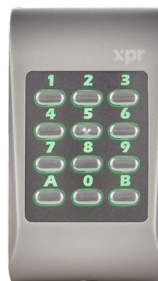
Green backlight Access granted

The MTPADP-RS-EH is equipped with an orange backlight that can be easily disabled if necessary with My WS4. The keypad changes its backlight color when the code or card is presented.