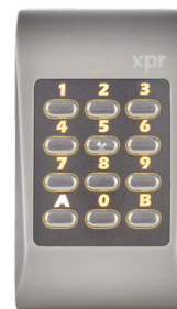
Orange backlight Idle mode