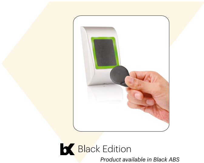
bx Black Edition Product available in Black ABS

MTPX-EH is a proximity reader with a polycarbonate front plate, available in a silver metal housing or in black ABS. It is elegant, slim and compact and its design is suitable for inside and outside use. MTPX-EH is compatible with most access controllers and Time and Attendance systems. It incorporates access control standard protocols such as Wiegand 24 to 42 bit.