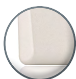
MTPXS-EH Silver - Metal